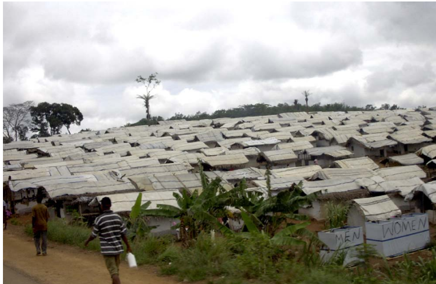
Fig. 1. Physical design and spatial location of shelters in internally displaced persons' camps, Bong County, Liberia, 2004.