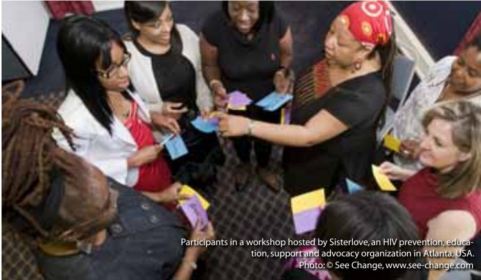
Participants in a workshop hosted by Sisterlove, an HIV prevention, education, support and advocacy organization in Atlanta, USA.