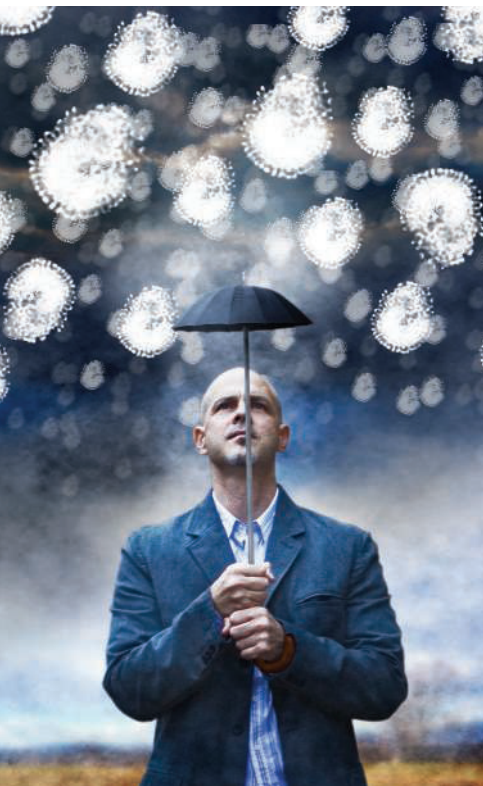
Preparing for a virus storm.

Whatever strategies are adopted, it is clear that additional anti-influenza therapeutics are urgently needed. So far, vaccines and antivirals have targeted three influenza envelope proteins: hemagglutinin, neuraminidase, and the matrix 2 ion channel protein. We need new classes of antivirals that interfere with other necessary viral processes (e.g., polymerase complex activity, interferon antagonist activity, and viral assembly). The desired outcomes of existing and future therapies (reduced severity, mortality,