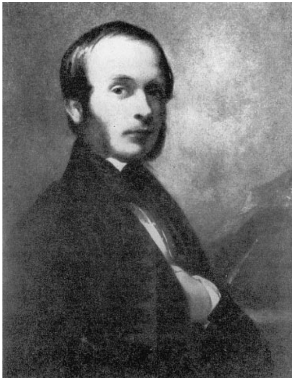
Figure 1 Dr John Snow (1813–1858).

Thomas Jones Barker returned to England and settled in London in 1845. Although he painted portraits and sporting scenes, he is best known for his historical paintings, especially the splendid battle scenes of the Napoleonic, Crimean and Franco-Prussian Wars. He was sufficiently successful to have employed a manservant, who also was a patient of John Snow's. His works, including his 1848 self-portrait, are owned by the National Portrait Gallery, the Victoria Art Gallery, Bath, and the Southampton Art Gallery. Prints of his battle