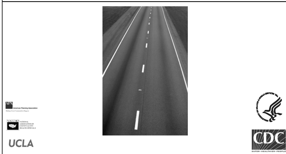
TABLE ACTIVITY: Sunnyvale Highway