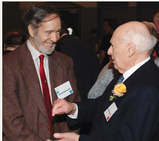
UCLA School of Public Health faculty member and 2003 Lester Breslow Distinguished Lecturer Jared Diamond (left) with the 2004 lecturer, Dr. Lester Breslow, at this year's event.