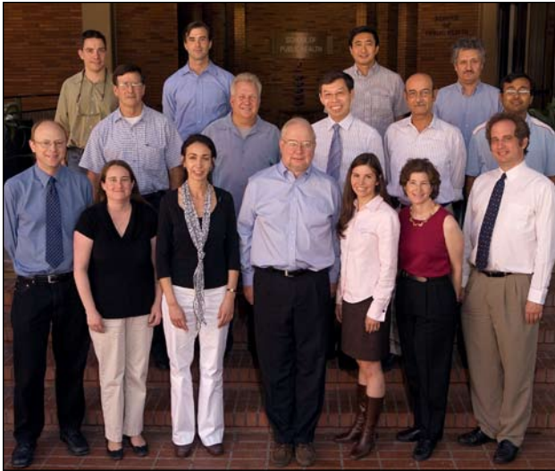
Department of Biostatistics Faculty

The school does not have a minimum combined score requirement. As a guideline, the average GRE scores for those offered admission over the past three years are Verbal: 600, Quantitative: 780, and Analytical: 680.